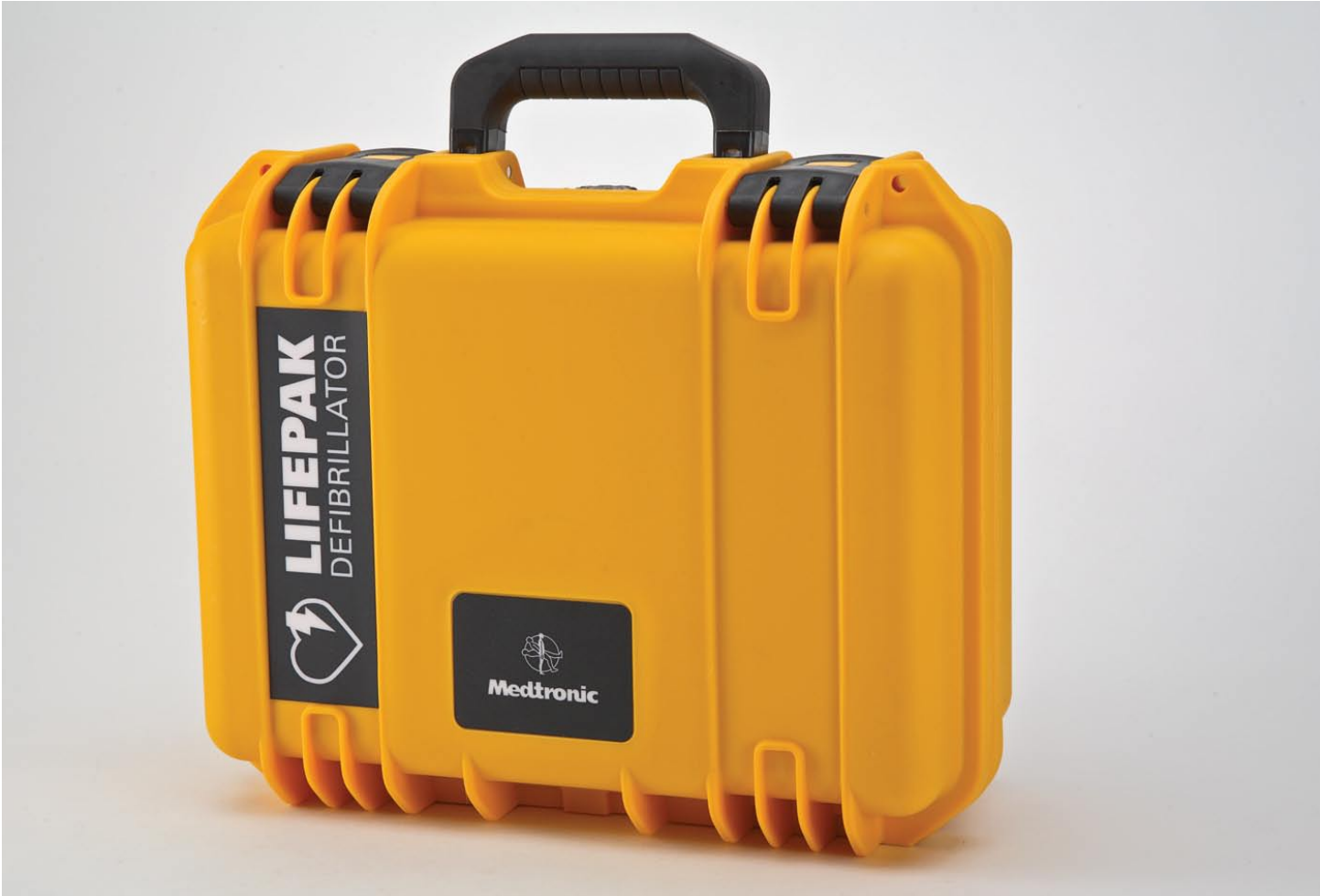
Hard-shell, Water-tight Carrying Case .....11260-00015

for LIFEPAK CR Plus/LIFEPAK EXPRESS AEDs