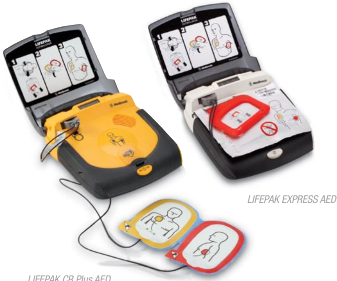
LIFEPAK CR Plus AED

for LIFEPAK CR Plus/LIFEPAK EXPRESS AEDs