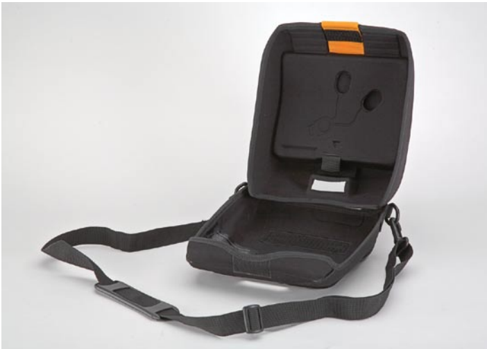
Complete Soft Shell Carrying Case.....21300-004576 Replacement Shoulder Strap for Carrying Case.....21300-004579